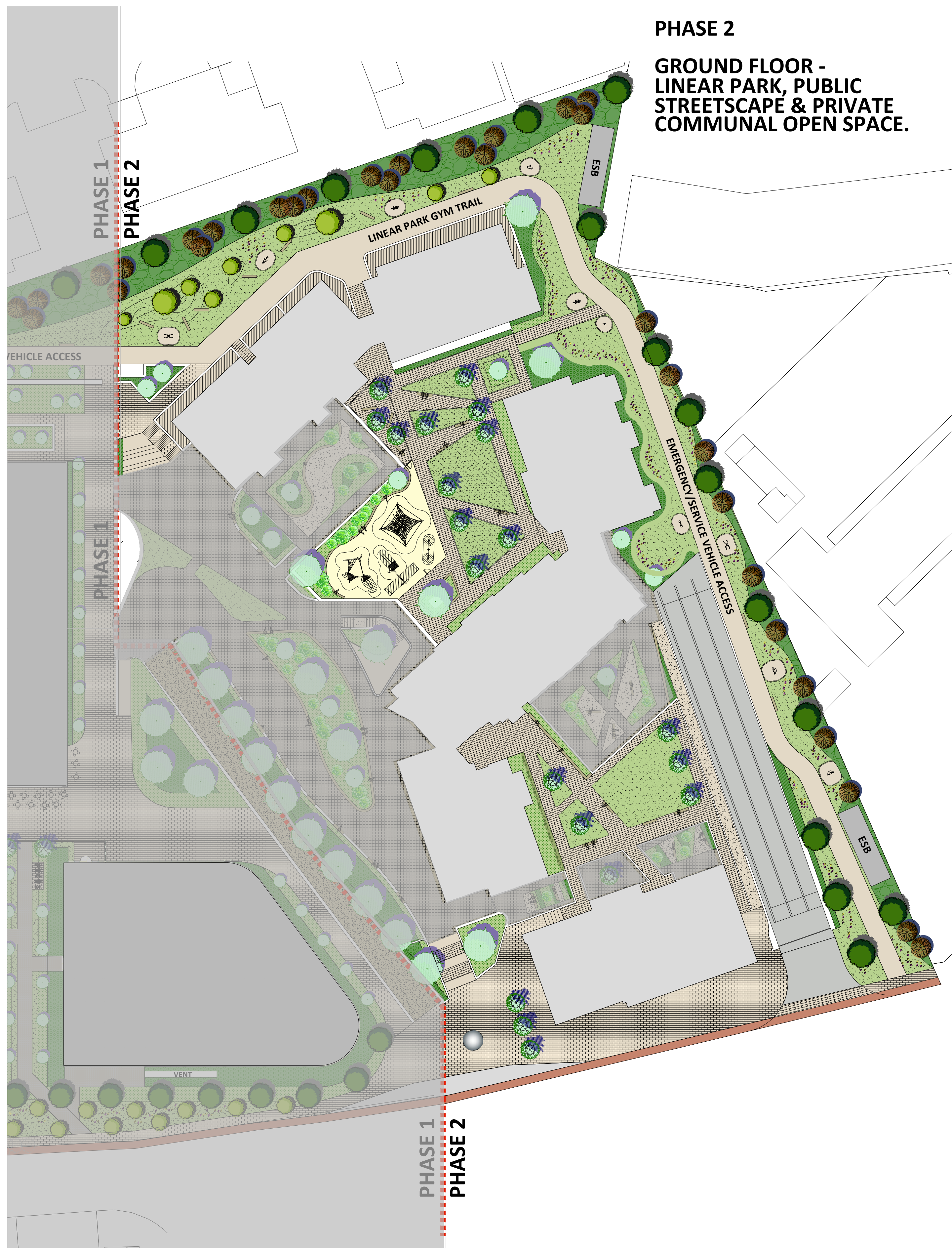
PHASE 2 GROUND FLOOR - LINEAR PARK, PUBLIC STREETSCAPE & PRIVATE COMMUNAL OPEN SPACE.