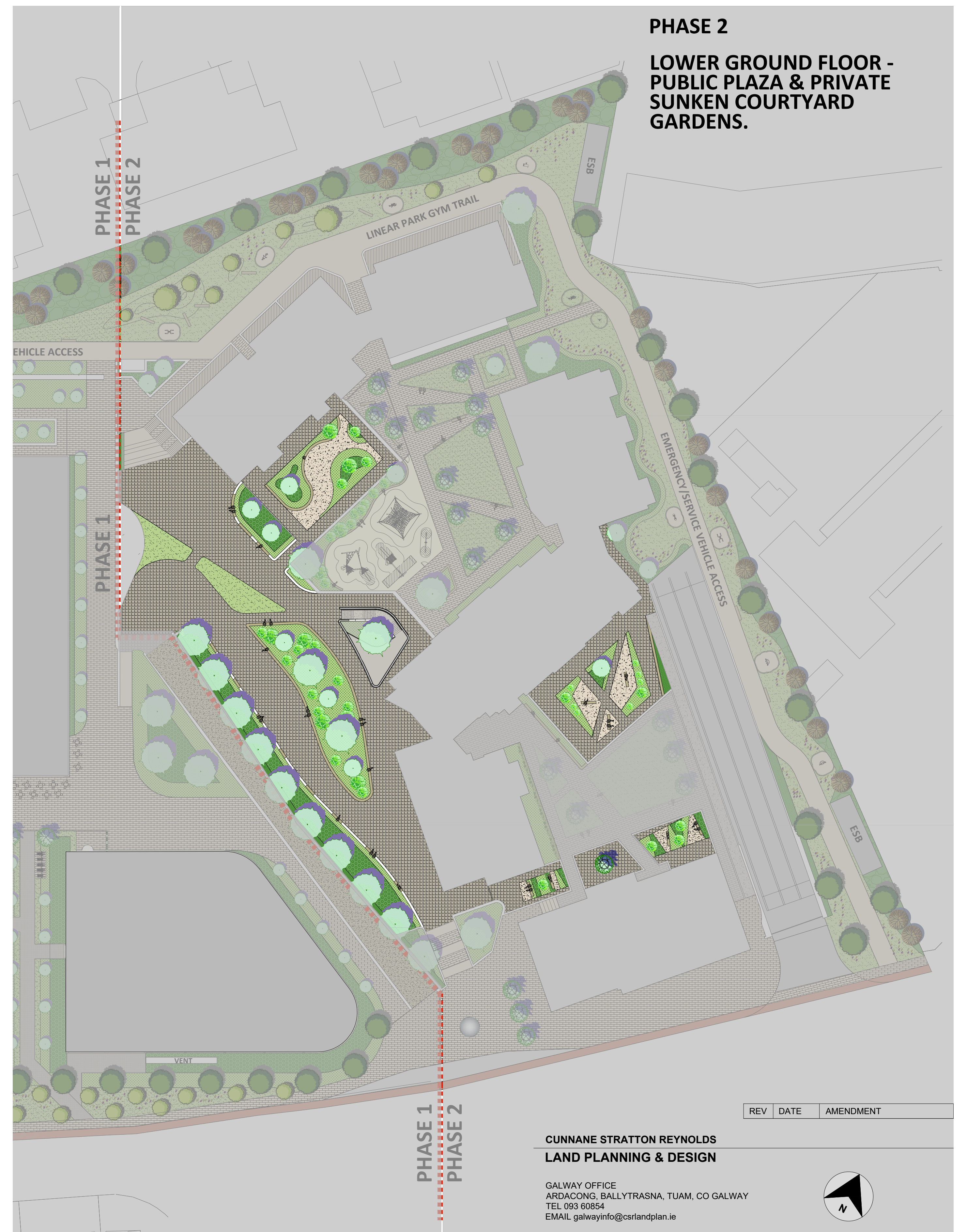
PHASE 2 LOWER GROUND FLOOR - PUBLIC PLAZA & PRIVATE SUNKEN COURTYARD GARDENS.